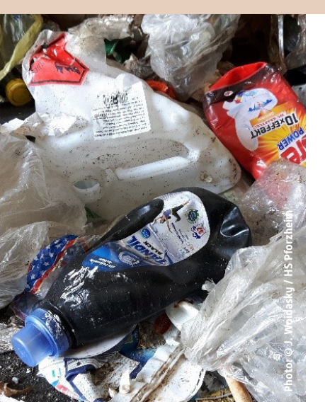
Dual systems collect lightweight packaging, primarily consisting of plastic, throughout Germany. Recycling rates for this kind of packaging will have to increase significantly in the next few years.

The German Packaging Regulation calls for a significant increase in recycling rates for plastics. Currently, plastics cannot usually be sorted satisfactorily by type. Therefore, the quality of the recyclates produced is often insufficient. In the sense of a circular economy, the detection, and subsequent sorting and recycling, of plastic packaging can be significantly improved by employing a fluorescent tracer (marker) system.