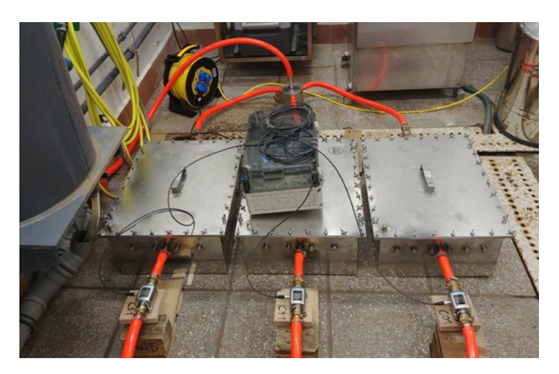
Use of pump-driven sedimentation boxes in a measuring station

be reliably determined by thermoanalytical methods such as Thermal Extraction-Desorption-Gaschromatography-Mass Spectrometry (TED-GC/MS). By means of fractionated filtration, it is also possible to assign the solids to specific size classes.